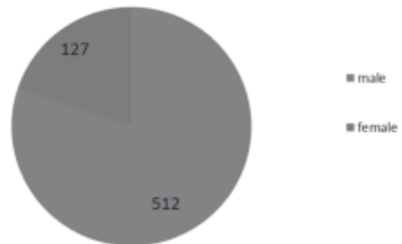
Fig 1: Gender distribution